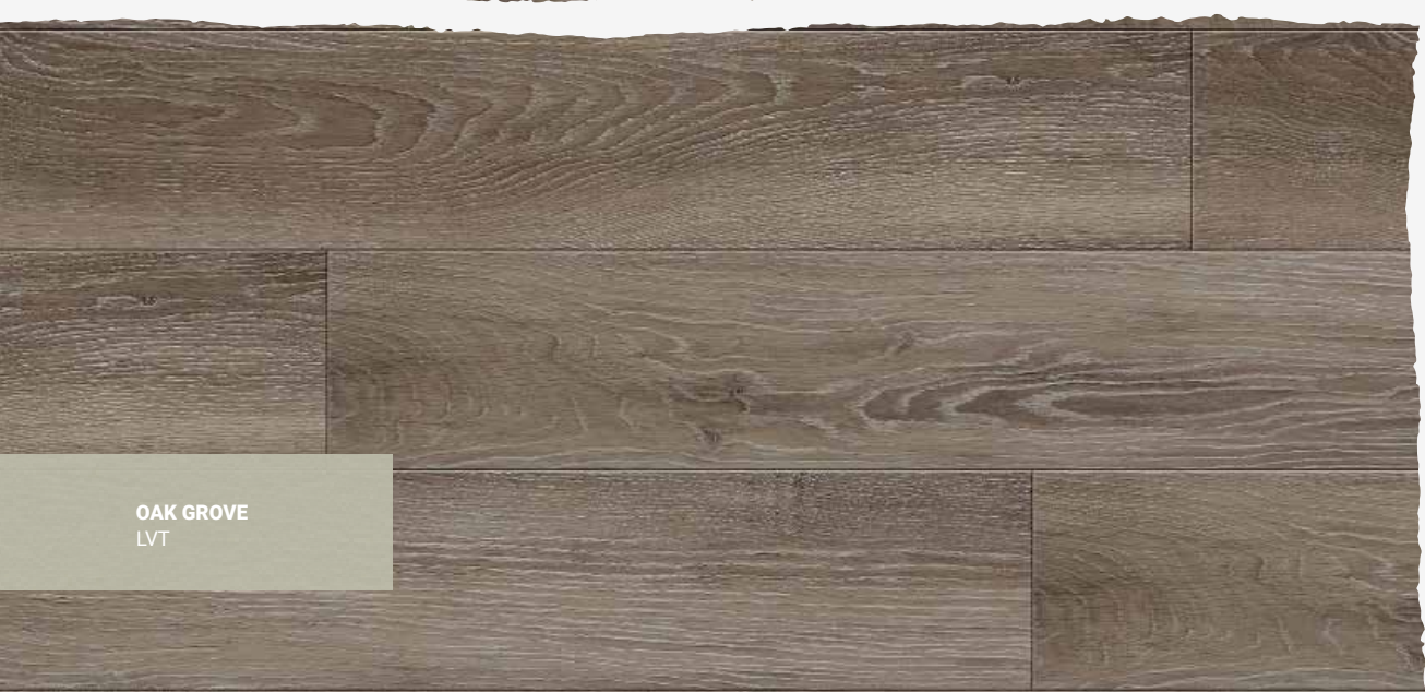
OAK GROVE LVT