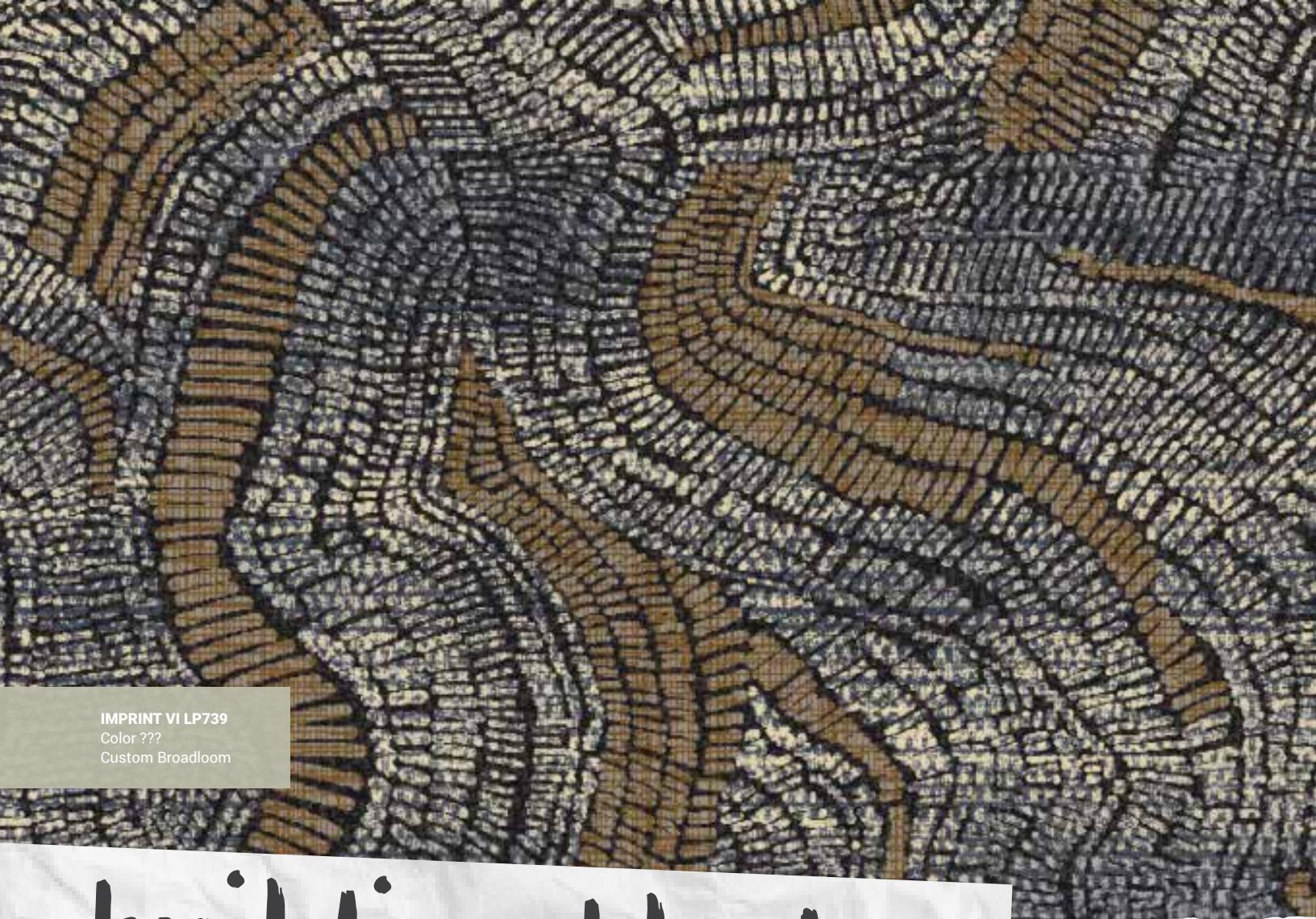
IMPRINT VI LP739 Color ??? Custom Broadloom