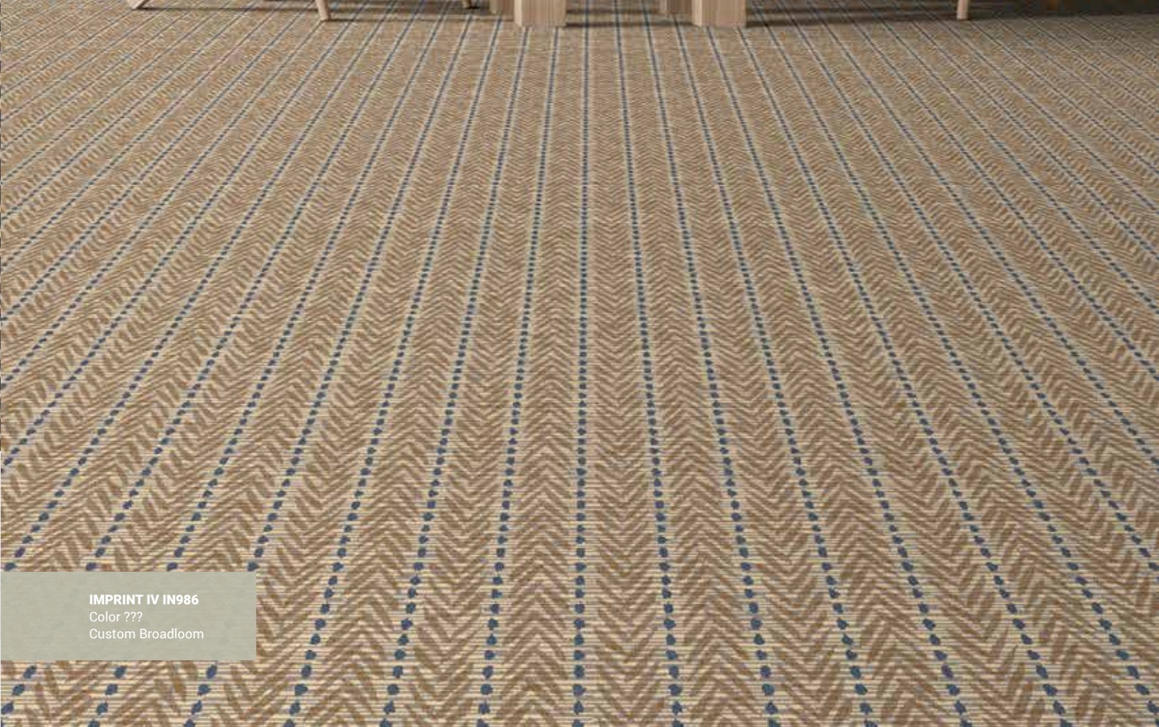
IMPRINT IV IN986 Color ??? Custom Broadloom