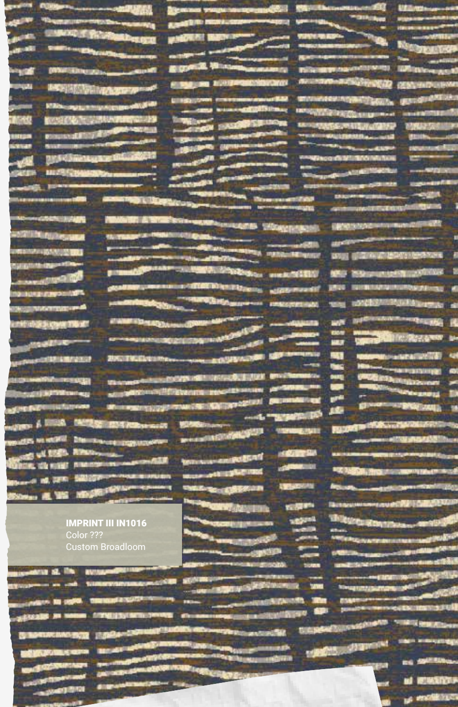
IMPRINT III IN1016 Color ??? Custom Broadloom