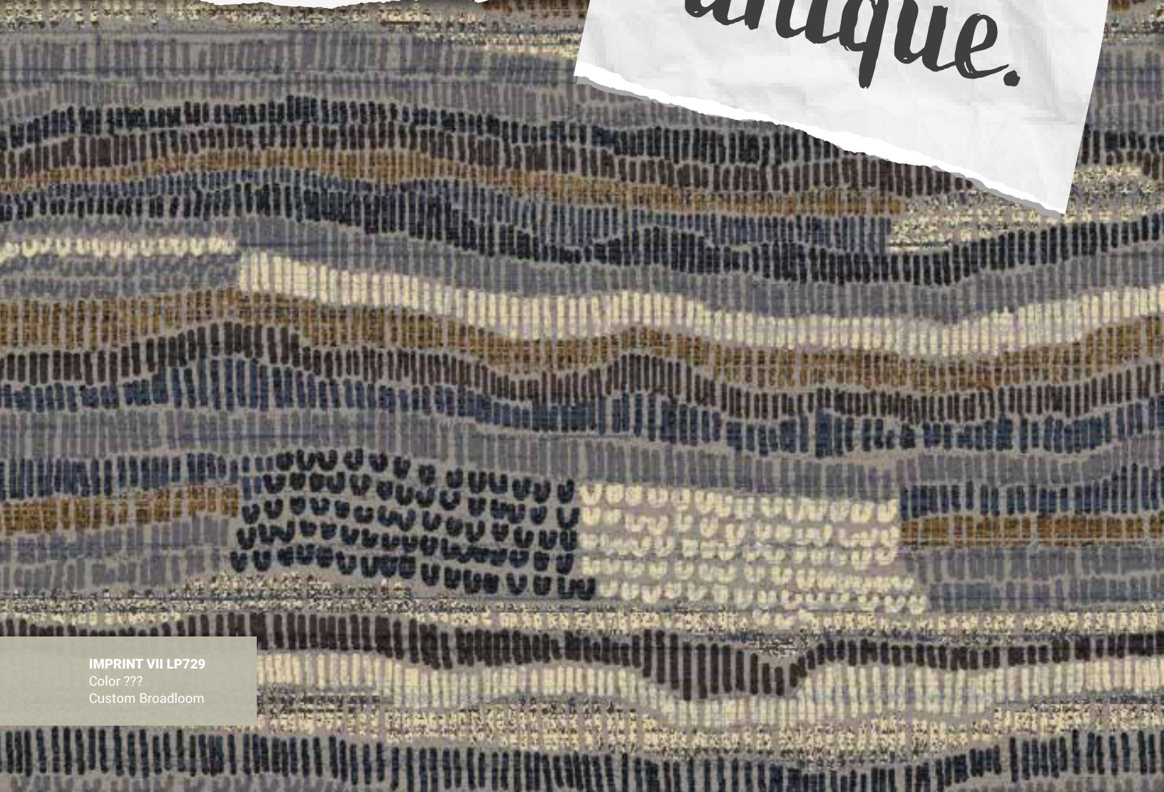
IMPRINT VII LP729 Color ??? Custom Broadloom