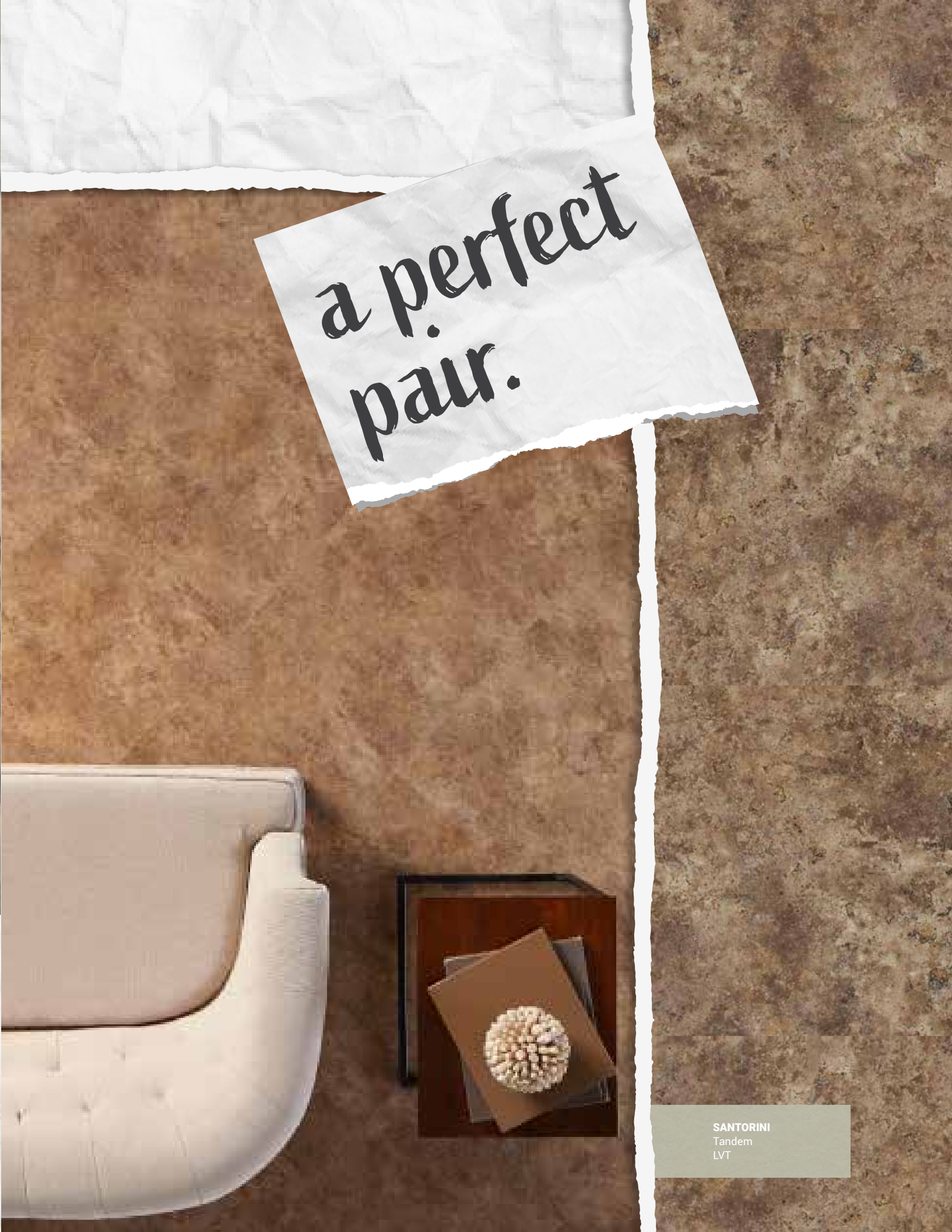
SANTORINI Tandem LVT