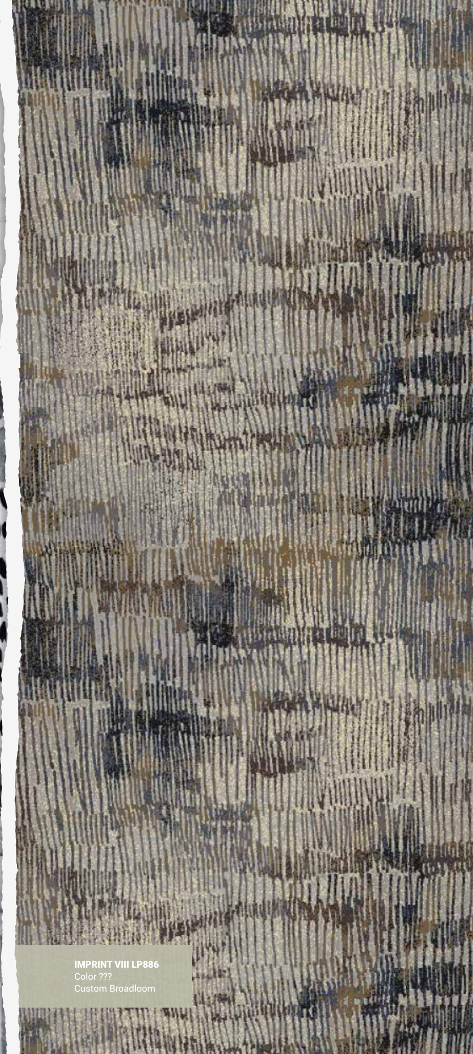
IMPRINT VIII LP886 Color ??? Custom Broadloom