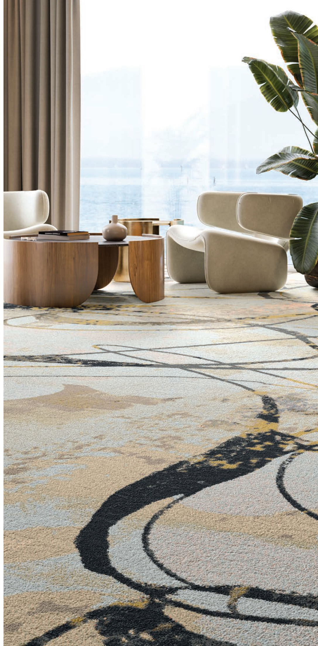
▼ Product Shown: Custom Axminster (BL5X-680)